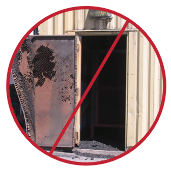
Failed Hollow Metal Door

Safer Workers – Doors are installed for a reason, and when they fail, dangerous situations occur. An industrial door can be the difference between business as usual and disaster.